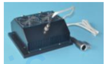
4) Completed installation