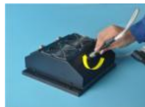
3) Clockwise rotate to lock