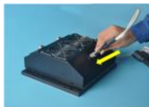
2) Align and insert