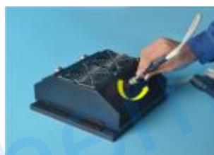
2) Anticlockwise rotate to unlock