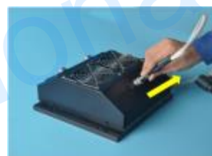
3) Pull out