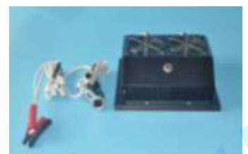
4) Completed disassemble